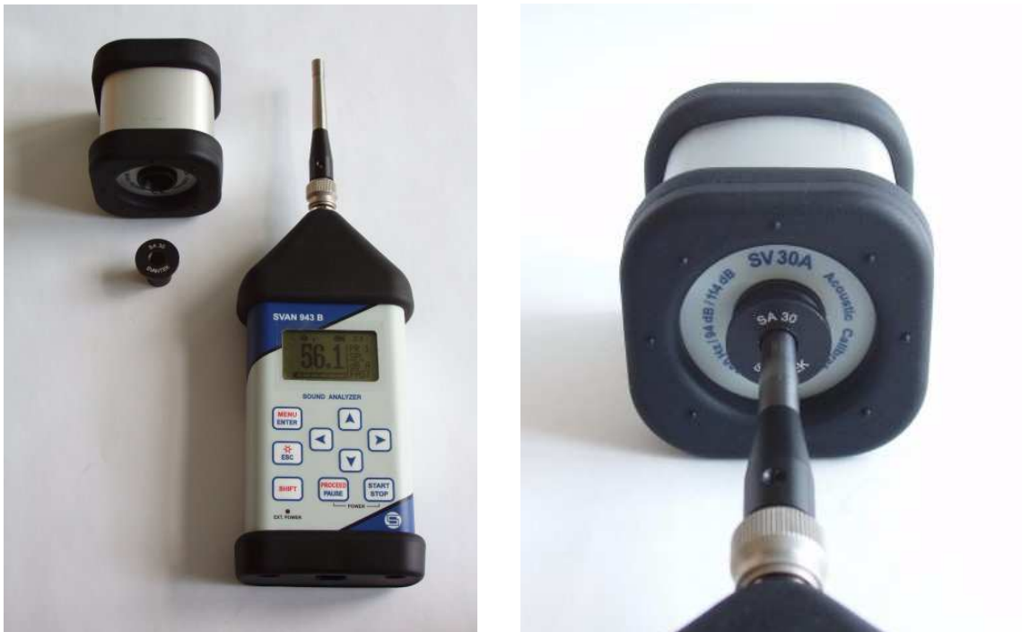
Picture 3. Calibration of the SVAN 943B sound level meter with a ¼" measurement microphone

Picture 3 presents the calibration procedure of Type 2 sound level meter SVAN 943B with a ¼" microphone.