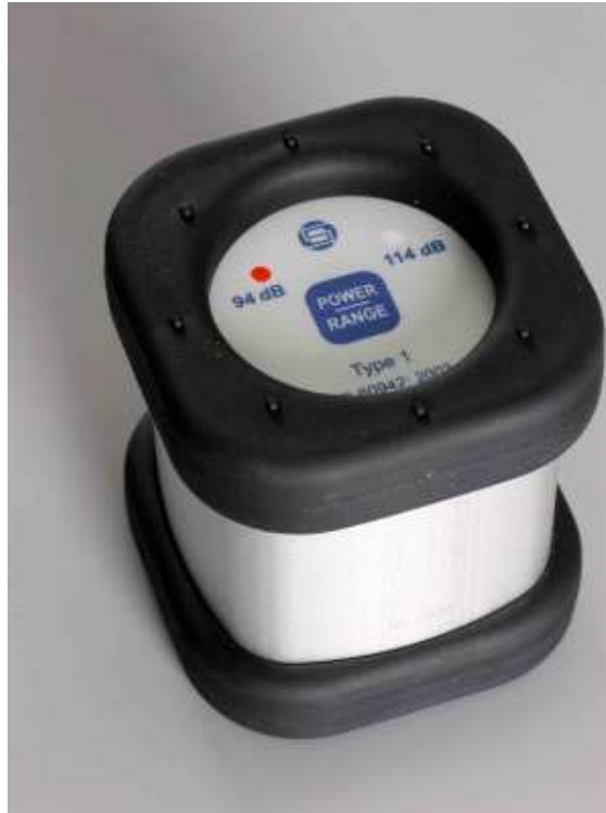
Picture 4. The top view of the SV 30A calibrator with one burning diode

Notice: Calibration should not be performed until the range diode is burning with continuous light.