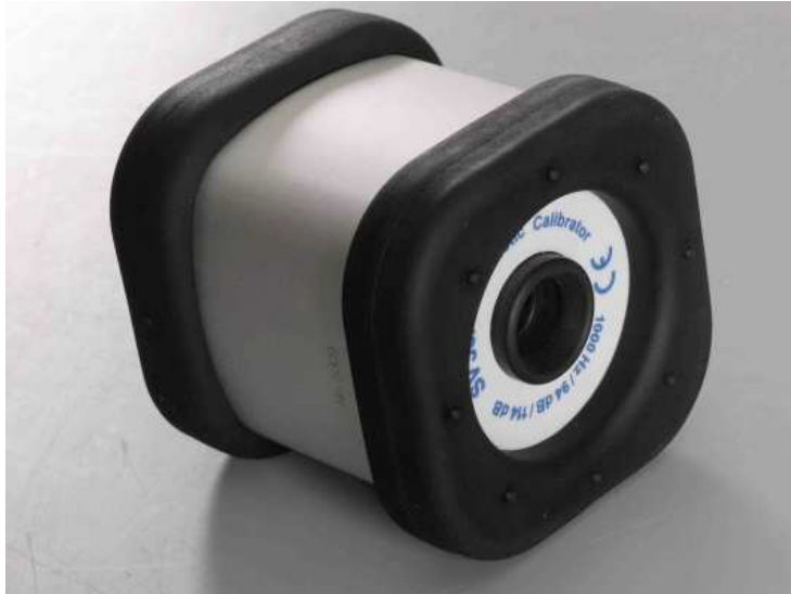
Picture 1. Acoustic calibrator SV 30A

The SV 30A is designed for calibration of sound level meters with \frac{1}{2} " and \frac{1}{4} " microphones. Picture 2 shows the calibration procedure of Type 1 sound level meter SVAN 945A with a \frac{1}{2} " microphone.