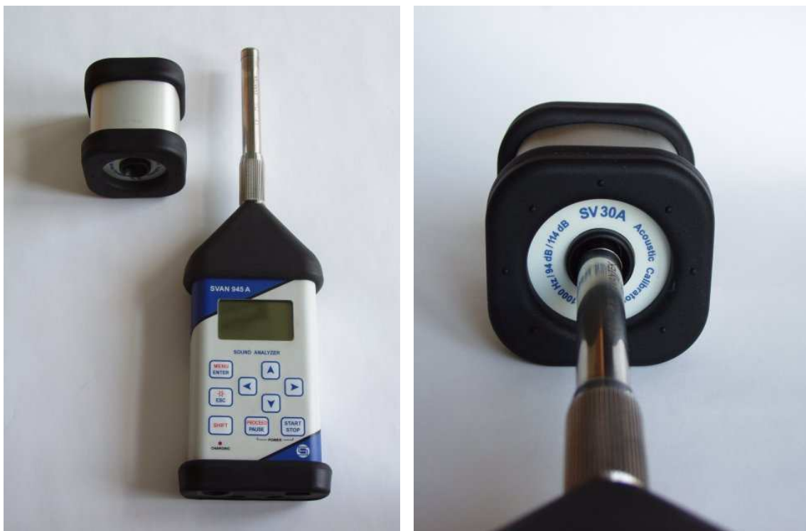
Picture 2. Calibration of the SVAN 945A sound level meter with a \frac{1}{2} " measurement microphone

The SV 30A is designed for calibration of sound level meters with \frac{1}{2} " and \frac{1}{4} " microphones. Picture 2 shows the calibration procedure of Type 1 sound level meter SVAN 945A with a \frac{1}{2} " microphone.