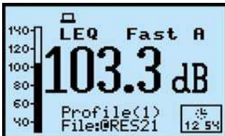
Main result in one profile view

**with USB 1.1 Host function not active and backlight off